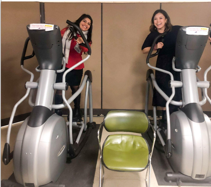
Hurley's free, 24/7 fitness center