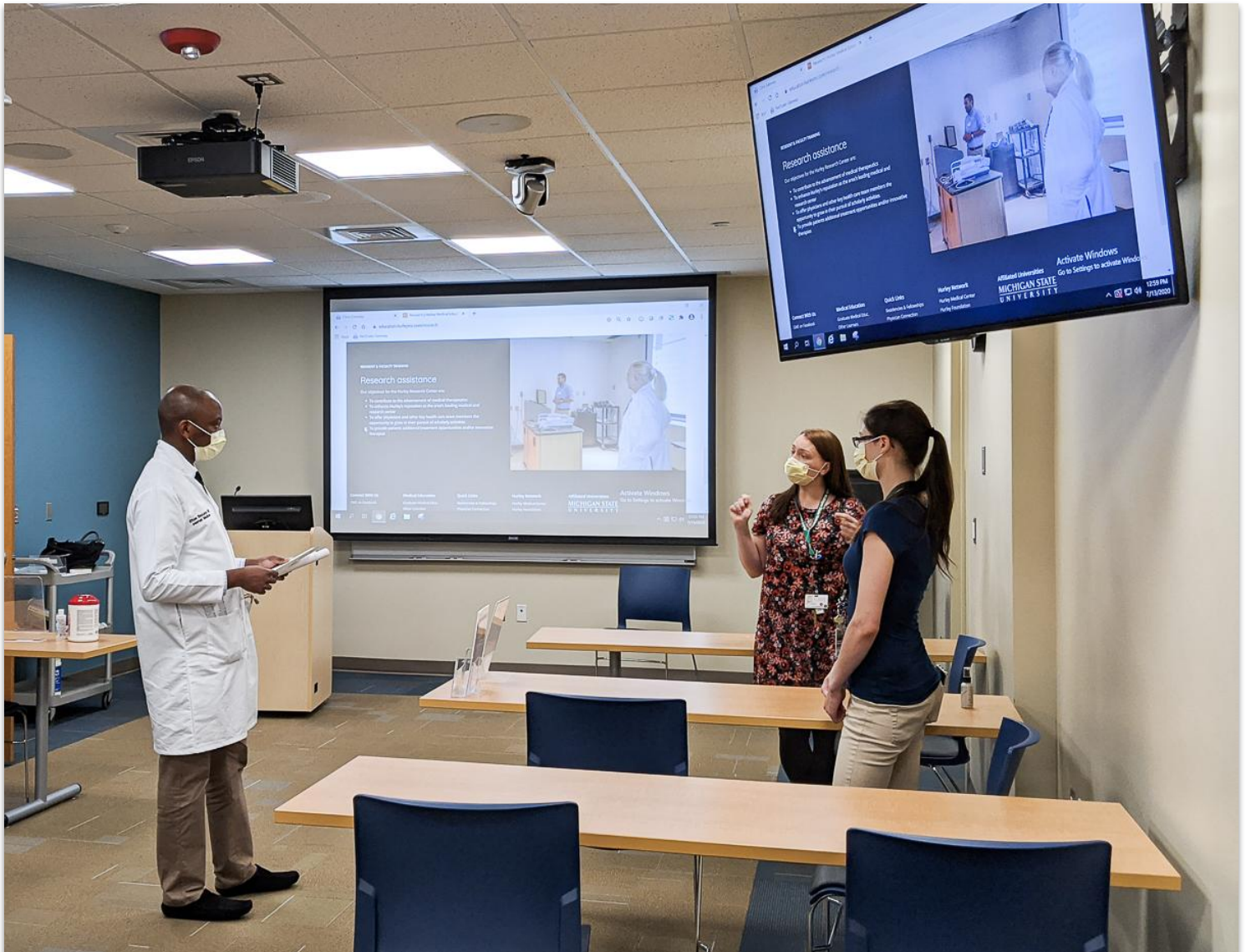
Hurley's Dr. R. Roderic Abbott Education Center