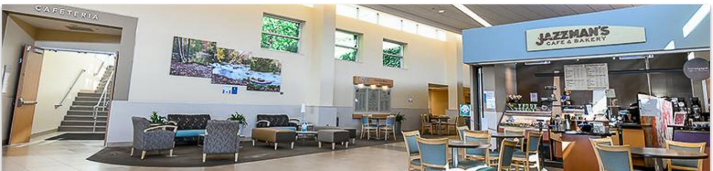
Hurley's main lobby